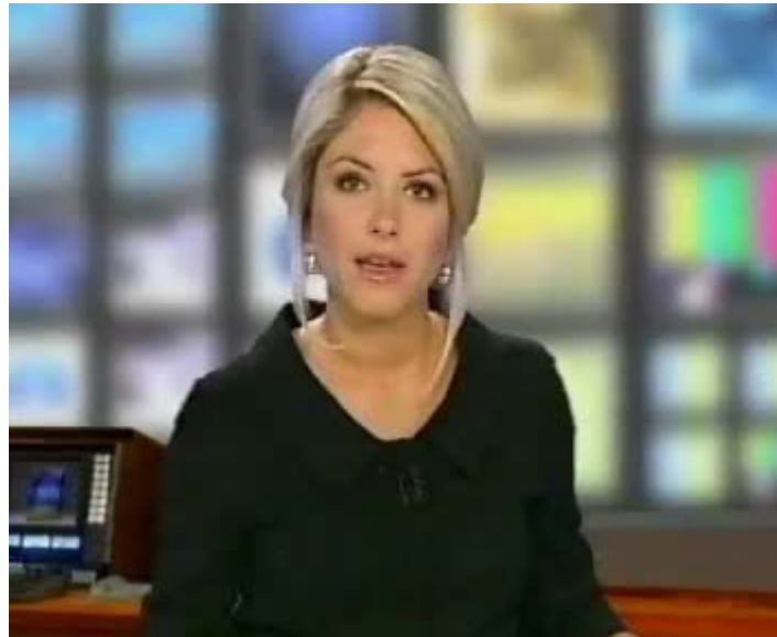
Video Footage WIN Television