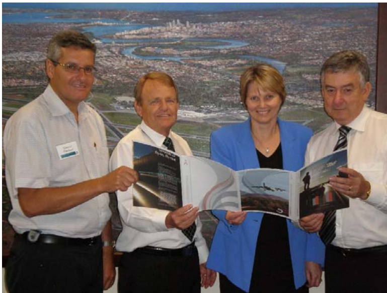
Perth Airport's Advisory Board meeting