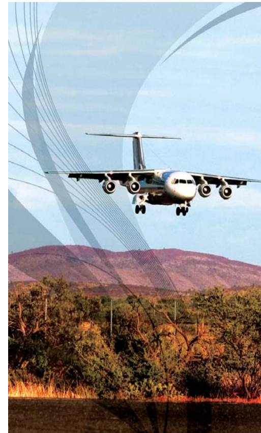
CME FIFO Publication