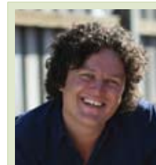
JOSH BYRNE sustainable gardening specialist and popular media personality provides advice on installing drip irrigation for a waterwise and healthy garden.

Drip irrigation can be installed into existing garden beds and laid in various patterns to suit the planting layout. Simply lay the drip line on the surface of the beds and mulch over the pipes to conceal them. If you are irrigating a veggie patch or annual