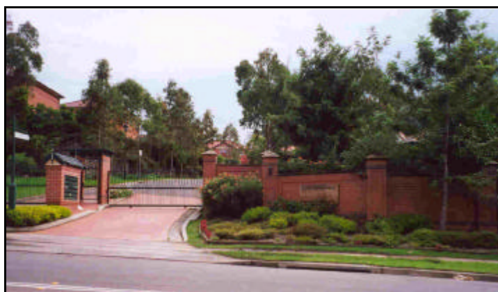
Figure 2. Mailboxes at The Manor , Cherrybrook, Sydney are both outside the gates and a significant distance down a steep hill from even the closest homes.

Should individuals choose to walk the extra distance to collect mail, papers, milk or other materials, this may be considered a positive impact for a sedentary Western population. Unfortunately this is not what appears to occur in many situations. Instead I have observed numerous instances where individuals prefer to drive to their mailbox, as appears commonplace at The Manor in the Sydney’s Cherrybrook [fig. 2]. Large numbers of short, cold-start motorised trips are generated.